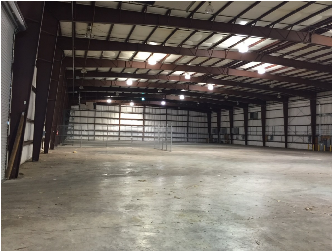
Interior 33,50 SF