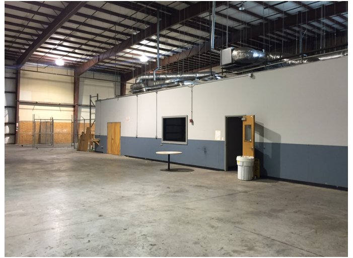
Interior office space