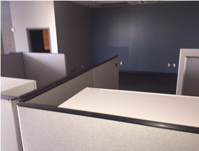
Interior office space