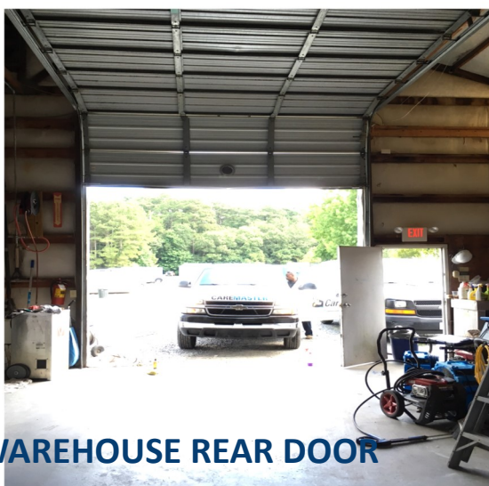
WAREHOUSE REAR DOOR