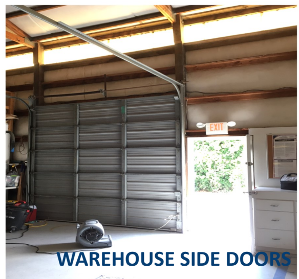
WAREHOUSE SIDE DOORS