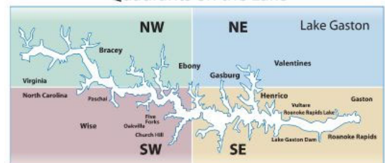
Quadrants on the Lake

And of course Lake Gaston Real Estate is a great investment; whether you are looking to retire, looking for vacation rental property, or just want to live on Lake Gaston, you can't go wrong.